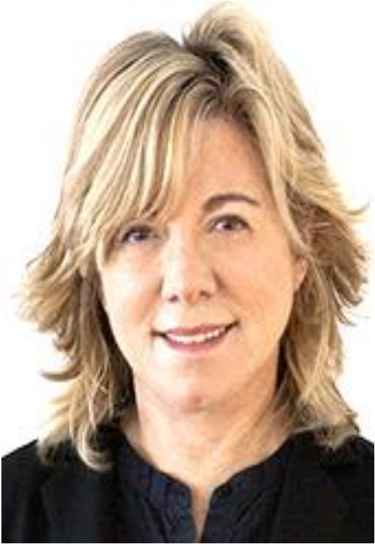
Keynote speech: Vera Pilar del Castillo Member EU Parliament TODAY, 11.30 – 12.30 AM